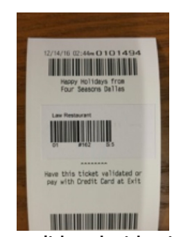
Ticket validated with sticker