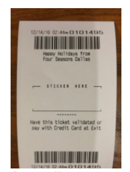
Ticket pulled by guest

Upon entering the garage, you will press a button and receive a white ticket. If you are staying the night at the hotel, your room key will grant you access in and out of the parking garage. If you are just driving in for the event, you will need to obtain a Discount Validation Sticker from a member of the Jerusalem Prayer Team staff at the information table in front of the Tate Ballroom. You will place the sticker on the ticket in the spot labeled, "Place Sticker Here," and it will enable you to receive the discounted self-parking rate. You will then use the validated ticket for the payment machine.